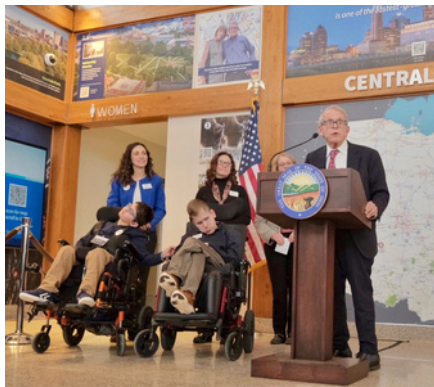
Universal Changing Stations at Ohio Rest Areas

DCY Grant: On Jan.29, The Dept. of Children and Youth will be releasing a grant application for public/private partnerships to expand childcare access. To learn more, click here.