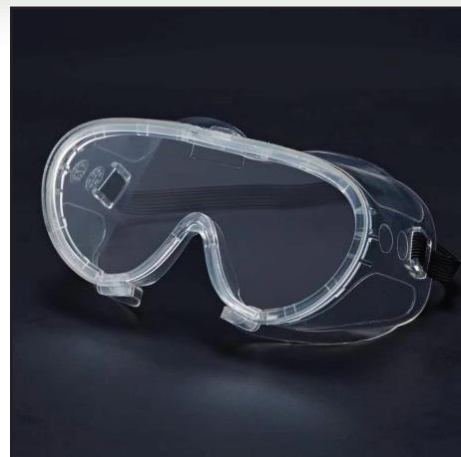
Full Seal Goggles, Blank