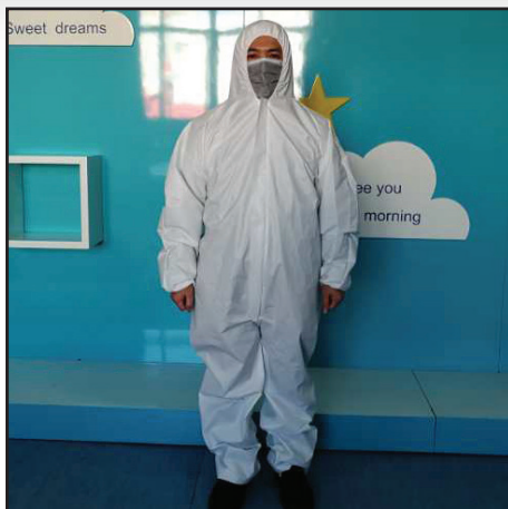
Isolation Gown, Blank