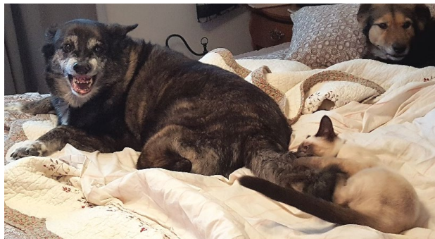
Sophie does NOT like it when Henry plays with her tail!