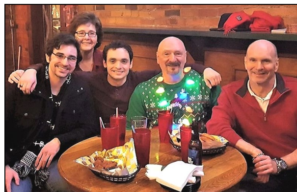
Our Christmas Eve Tradition: Going to a bar, then onto Christmas Eve Service!