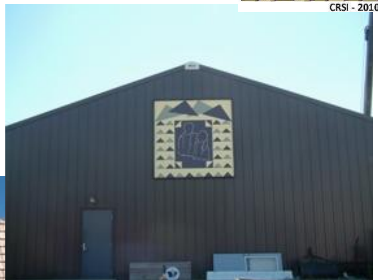
Corporate Office Maintenance Barn Rear Entrance U.S. HWY 36