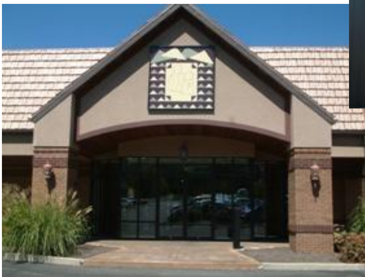
Corporate Office Entrance 1150 Scioto Street Urbana, Ohio