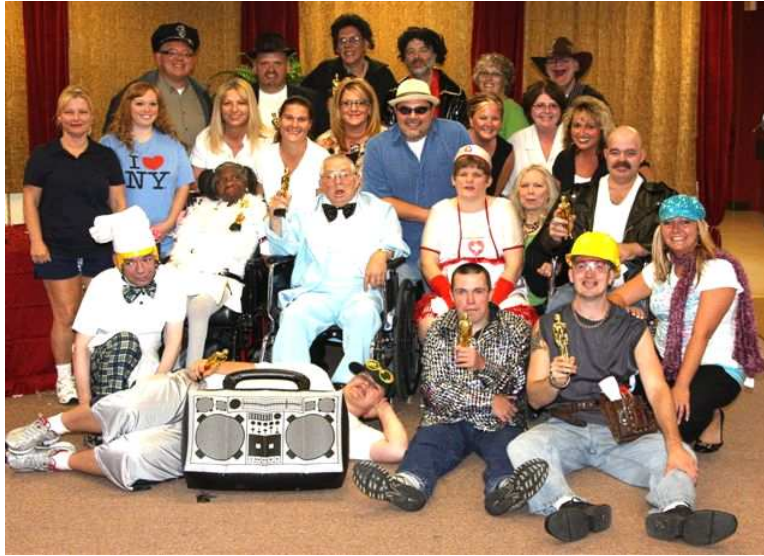
"Just Desserts" cast members include CaDC residents and staff.

Read more about this original theatrical production in the next issue of Pipeline Quarterly , reporting on Summer 2010 ... coming soon!