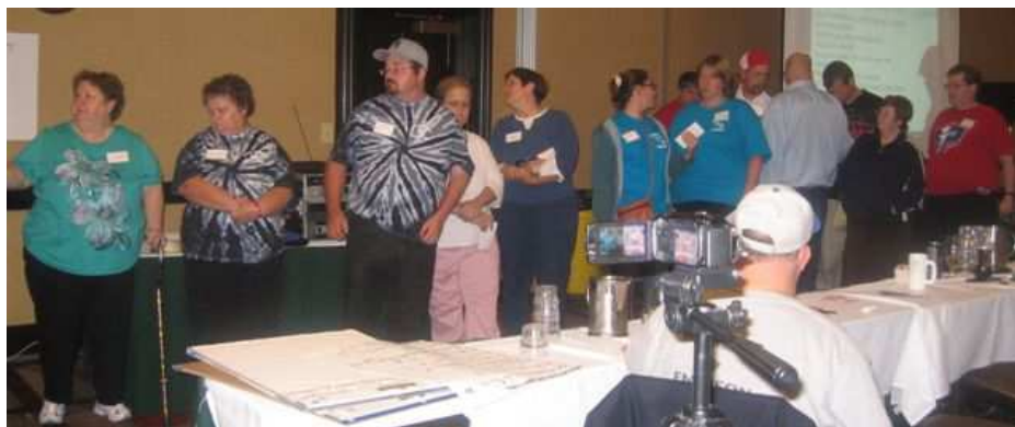
Lining up to continue the democratic process.