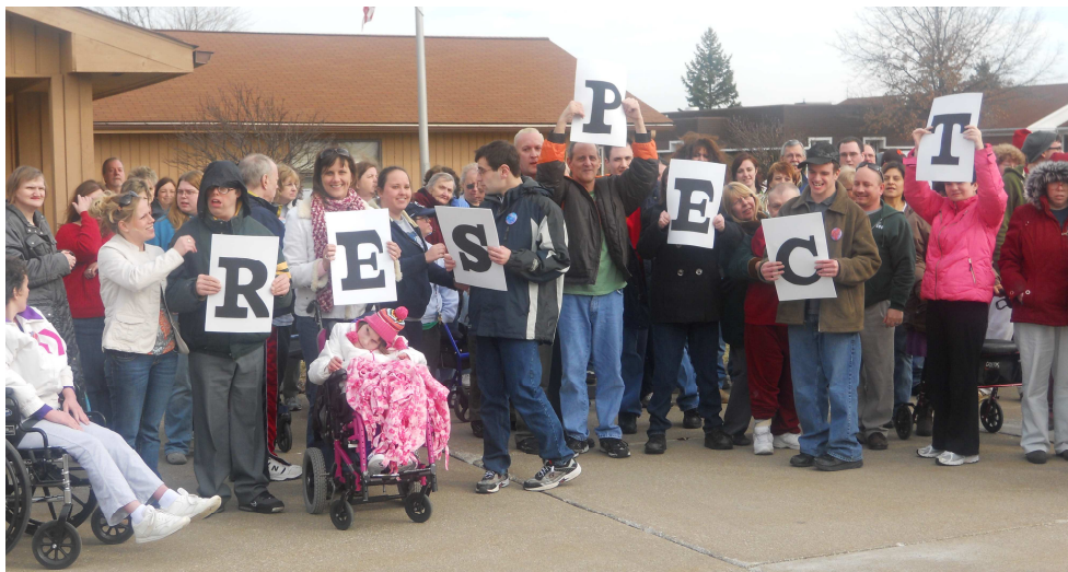
SHC/The Arc of Medina County: Taking a look at the Big Picture

SHC/The Arc of Medina County, a grassroots organization providing services to individuals with developmental disabilities for more than 58 years, "took a look at the big picture" this year. As one of the 700+ national chapters of The Arc, SHC/The Arc celebrated Developmental Disabilities Awareness Month with a photo shoot, including nearly 100 individuals, staff, families, and others. They held high the letters spelling the "R-word" they like -- "RESPECT."