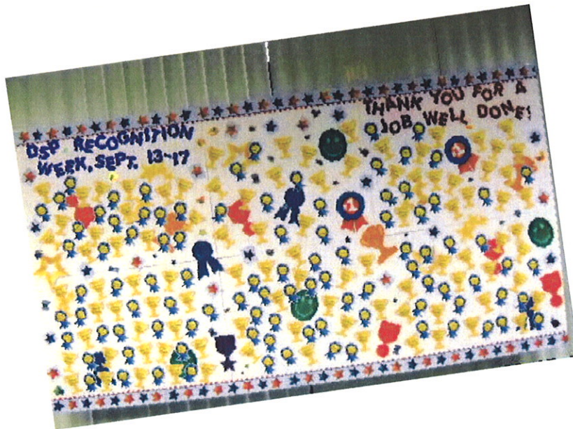
Poster hanging in the office at The Welcome House with each DSP's name

Flags designed by individuals with developmental disabilities served by Wood Lane Residential Services hang in the Wood County Courthouse.