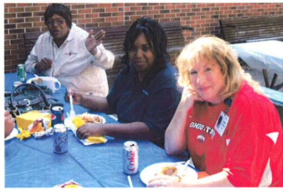
Staff at Rose-Mary enjoy a tailgate party!