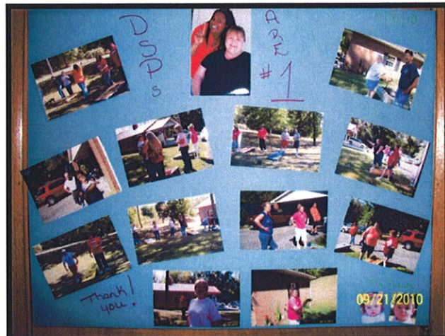
Picture board at Guernsey Residential's office that commemorates DSP week