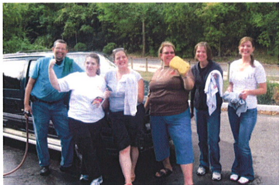
Supervisors at LADD offer DSPs a free carwash!