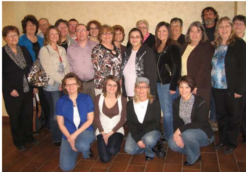
Morgan County, Closed for the Day.

"I call it a smile. You call it an 'outcome'. Either way, it's a great feeling."