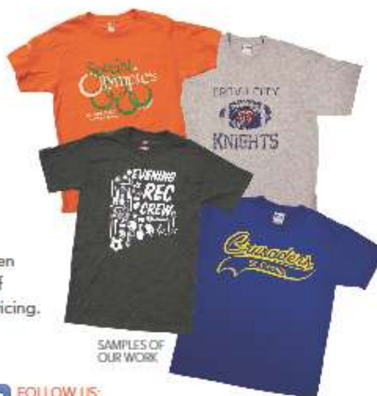
SAMPLES OF OUR WORK